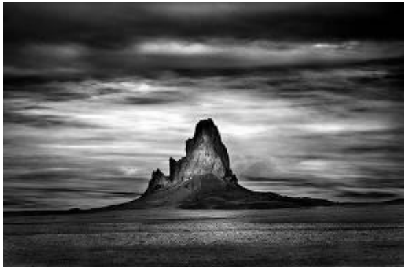
Mitch Dobrowner, El Capitan Valley Arizona

Clumps of mountains dot the horizon, rising in rugged splendor above the sloping valleys and flatlands that surround them. In the clear desert air, they are easily visible from miles around. The morning and evening light and stormy skies make them just pop up out of the landscape.