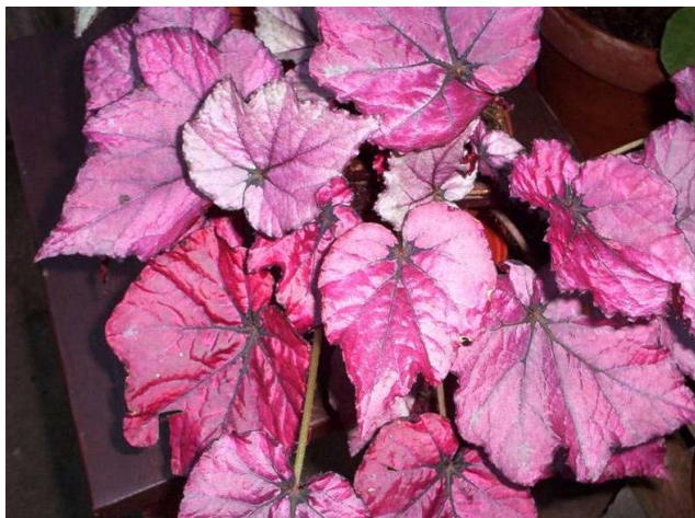
B. 'Hot Stuff' is a rex hybrid whose color captures the allure of this begonia group.

Rhizomatous begonias make the best houseplants. Where all the previous groups have stems that grow upright with a noticeable space between the leaves, this group has stems that sprawl along the ground with no space between each leaf. This group has the greatest variety of leaf sizes and shapes. They can be as little as an inch in size to two feet in diameter. In shape they can be round, lobed, or be cut so deep as to look like individual palm fronds. The edges can be deeply crested so as to look like the leaf has fringe attached. Some have spiral curls, single or double. Foliage color in this group varies from light to dark green, or can be reddish, bronze, brown or nearly black.