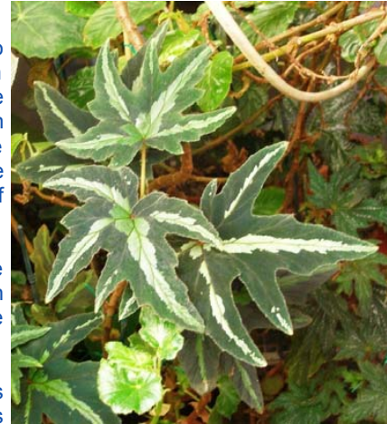
B. leathermaniae is a cane-like species from the rainforests of Brazil.

The rex begonia is the colorful king of the family. It is actually separated out from rhizomatous types because of its colorful foliage and its ability to trace its heritage back to a single species that grows in the foothills of the Himalayas, a plant named Begonia rex . This group is also a good candidate as a houseplant.