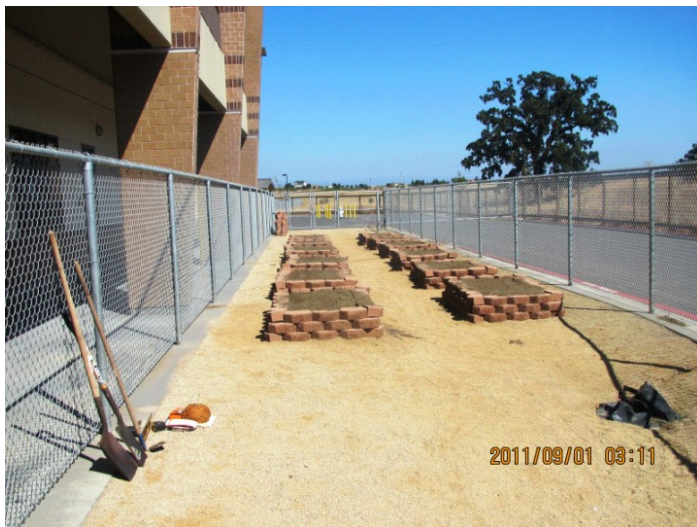
Progress is apparent as the Cosumnes River Elementary School (CRES) garden project raised beds are created. This project has been years in the making and we are finally seeing results.

As we progress, I will keep you updated. And thanks for all your interest.