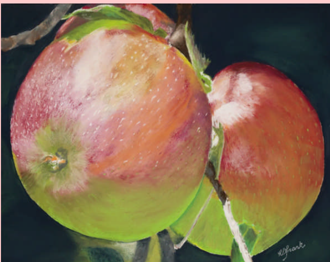
Two Beauties - Apple Hill, CA