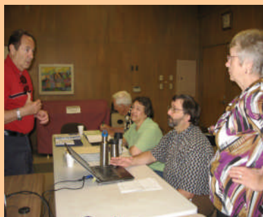
Annual Board Meeting 2010

STEP UP AND BE A DEFINING FORCE IN THE OPERATIONS OF OUR CENTER