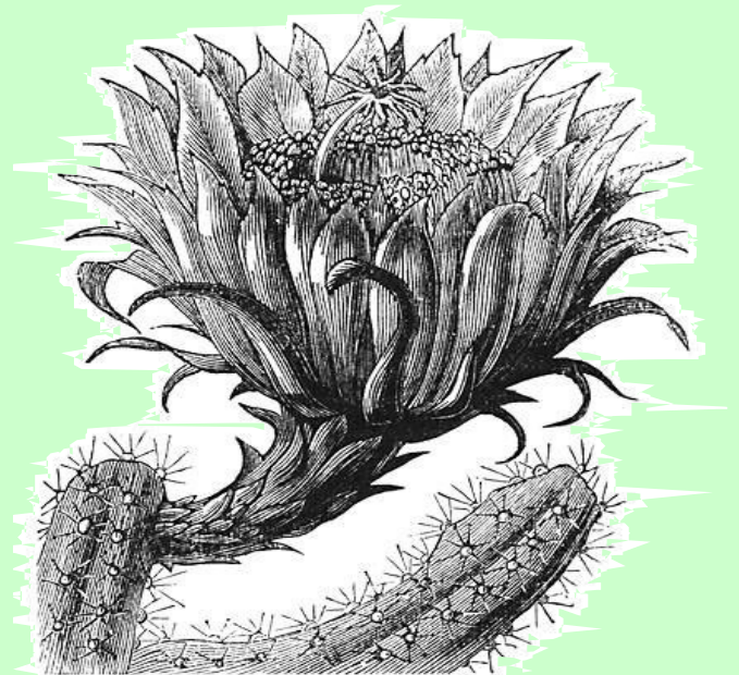
Selenicereus grandiflorus (Queen of the Night)

WWW.SACRAMENTOCSS.ORG SHEPARD GARDEN AND ARTS CENTER 3330 MCKINLEY BLVD SACRAMENTO, CA 95816 (916) 808-8800